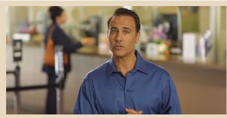
How Can I Make a Payment