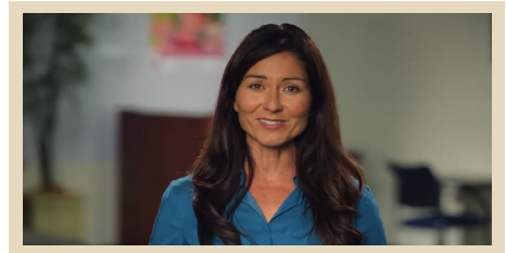
Understanding Your Billing Statement